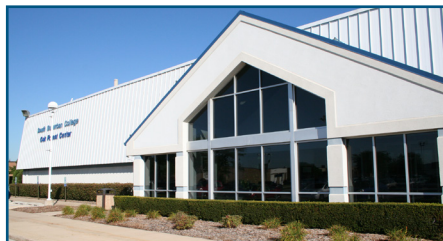
Oak Forest Center • Oak Forest, IL