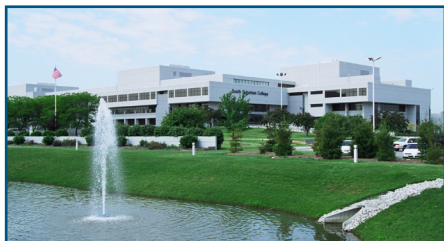
Main Campus • South Holland, IL