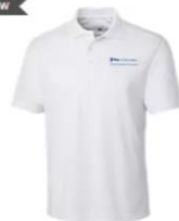
South Suburban College Ice Polo Clique $30.00