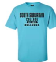
see more colors South Suburban College Short Sleeve T-Shirt MV Sport $12.95