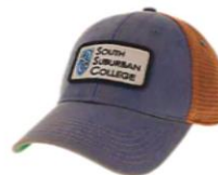
South Suburban College Trucker Cap Legacy $26.00